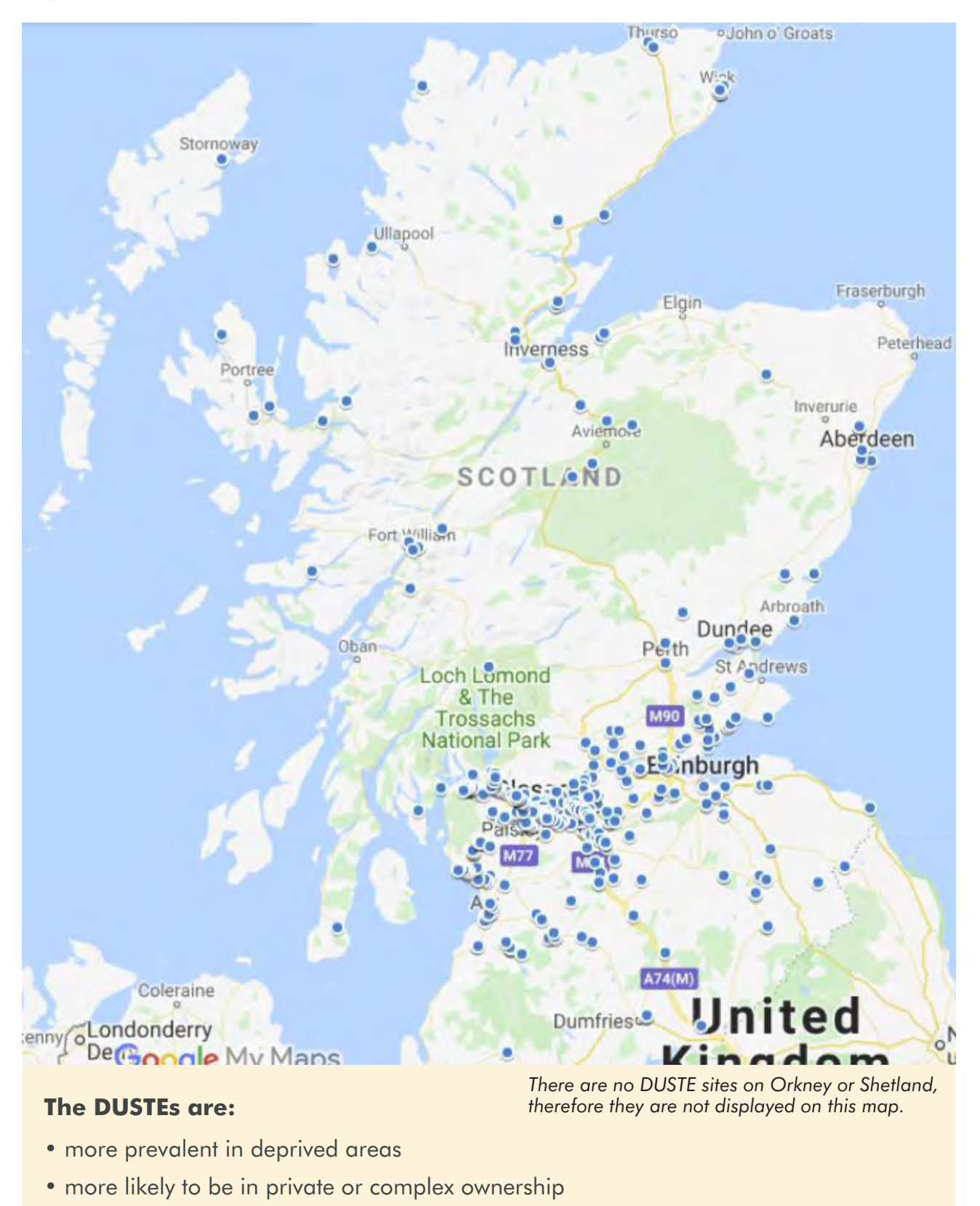
Fig.1 Scotland's DUSTEs<sup>8</sup>